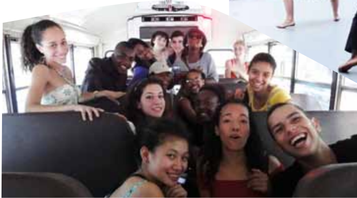
On tour in the van