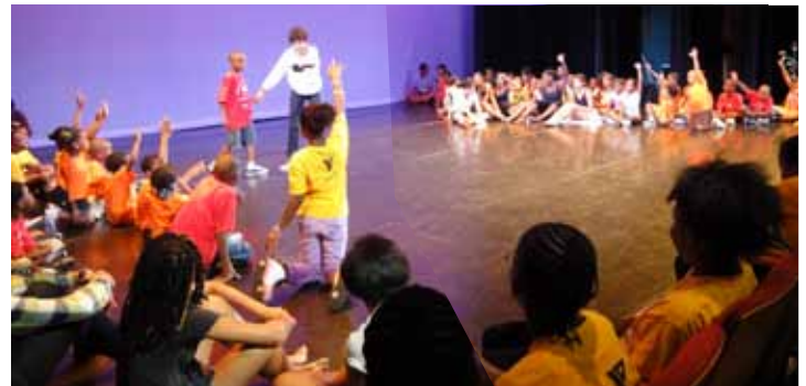
at Kumble Theater