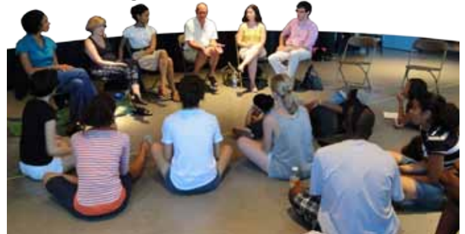
Representatives (L to R) from Dance Theater Workshop, Hofstra, Ailey/Fordham, NYU, Marymount, Juilliard