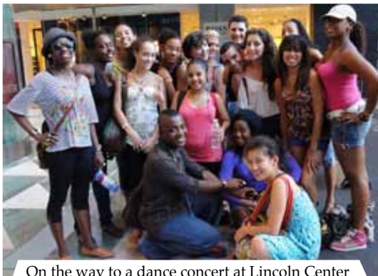
On the way to a dance concert at Lincoln Center