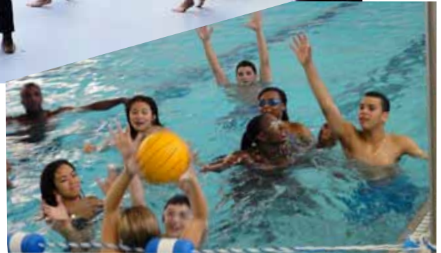
An afternoon off