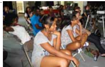
YDC gathers for the 2010 DVD release