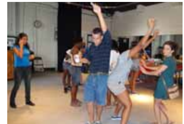
And a farewell party