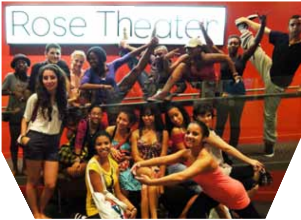
YDC at the concert