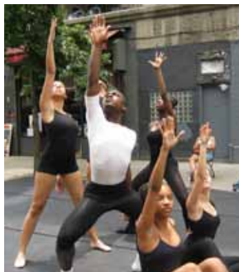
"Right Outa the Gate" created spontaneously at the YDC Orientation in May and performed June 4 th for the Downtown Arts Festival on E. 4 th St.