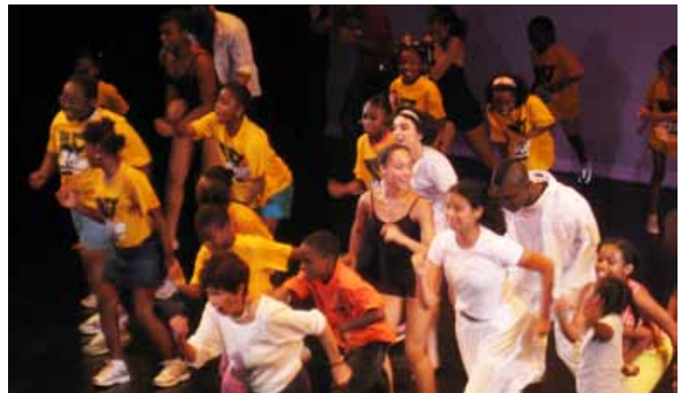
at Ailey Citigroup Theater